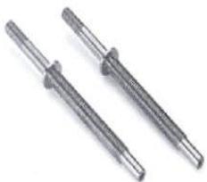
Interchangeable endless main screw: 0.2 - 0.4 - 0.6 - 0.8 mm. (0.0078 - 0.0157 - 0.0236 - 0.0314)