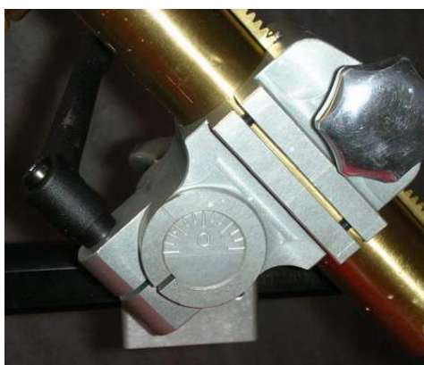
Adjustable torch holder

Available in manual or motorised versions. Motorisation kits can be fitted retrospectively.