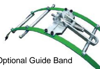
Optional Guide Band

The GB CUT F1 can cut & bevel pipes from 4" to 80" diameter. The torch is mounted in a holder which can be adjusted through 3 axes for perfect positioning. Triplex link chain and adjustable wheel positions enable the GBC CUT F1 to perform precise, square cuts.