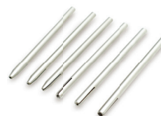
Bushes for short electrodes