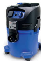
Dust Extraction Unit