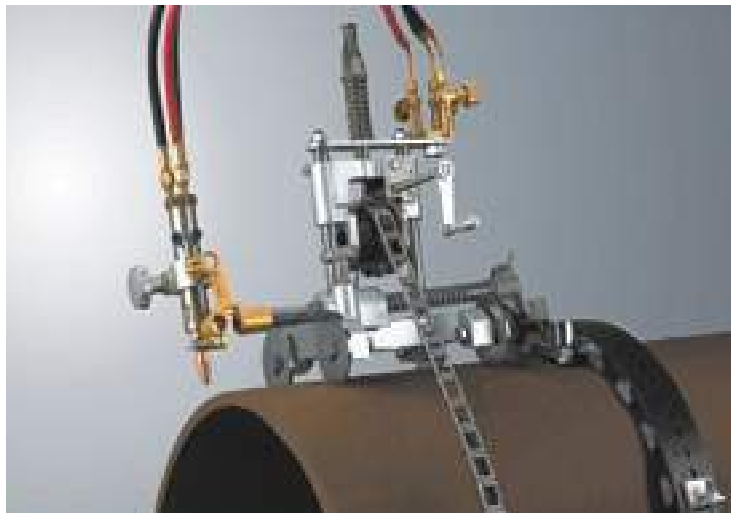
Guide Band ensures accurate square cuts