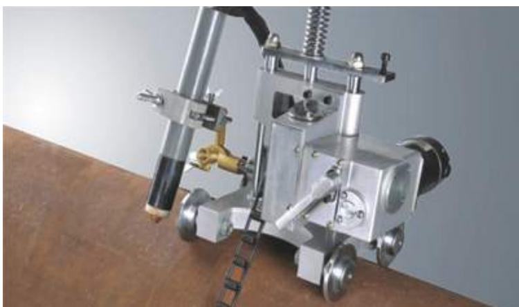
Motorised plasma cutting version

A manual chain driven pipe cutting machine that provides smooth, accurate cutting action by incorporating a low gear ratio and worm gear drive. Cuts 5 - 50mm wall thickness on pipe with 114 - 600mm (4" - 24") diameter. Beveling head angle can be set quickly and accurately by scale on a rack and pinion. This complete package is supplied together with a 2.4m length of guide chain and a selection of ANM cutting tips. Solidly constructed using brass, chromed and stainless steel parts.