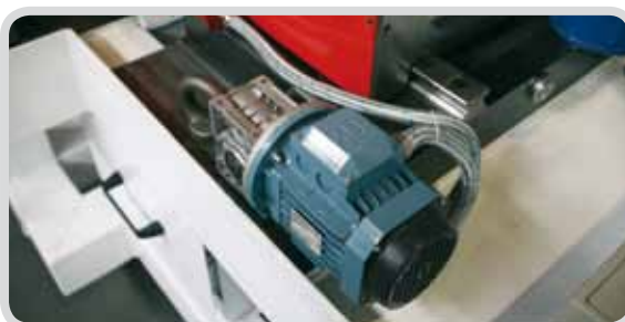
Detail of the mobile head feeding motor