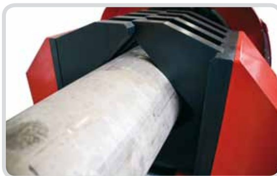
Detail of the locking vice

Semi-automatic unit structurally strong and at the same time user friendly. The locking vice design enables the automatic centring and positioning without causing deformation to the pipe.