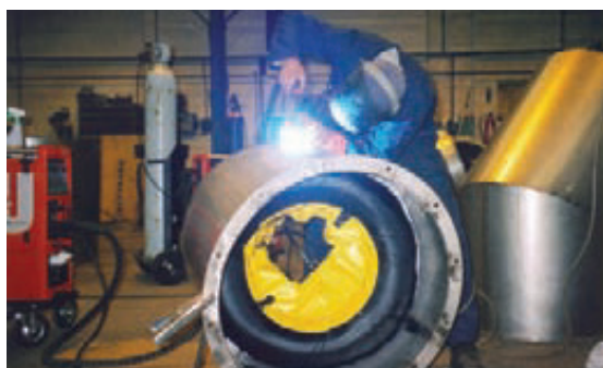
Speedy Purge used to weld a stainless steel elbow.