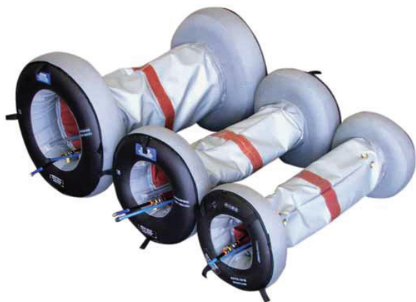
Speedy purge heat resistant bags